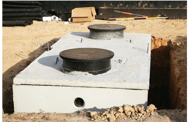
Example of a gravity grease interceptor

Gravity Grease Interceptor: Food service operations that generate large amounts of FOG are considered significant generators and generally need a gravity grease interceptor, with some exceptions. A gravity grease interceptor is typically a large tank installed underground outside the building.