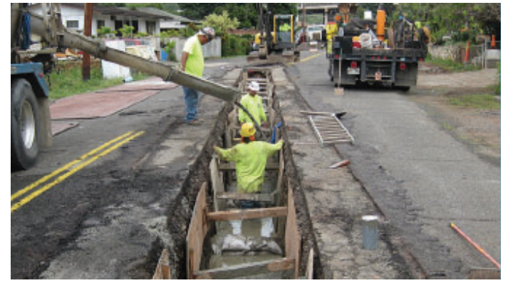
Construction of local sewer by open cut (trench)